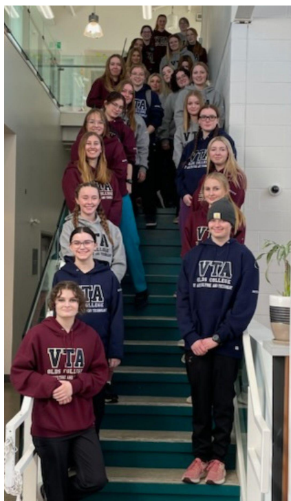
Veterinary Tech - dual credit students

The goal of dual credit is to provide students with skills and experience necessary to transition successfully to post-secondary learning for their career of choice learning. We want students to leave high school engaging in the career pathway that they are passionate about. About 490 Chinook's Edge students enrolled in dual credit this year.